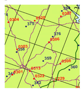
Figure 1: MESAN grids

The Salt Index is based on data from our 775 Road Weather Information System (RWIS) stations as well as data provided by the Swedish Meteorological and Hydrological Institute (SMHI) and the total amount of salt used. Basically, we use the former for information on the air and road surface temperatures, humidity and SMHI data for the wind and type and amount of precipitation. The RWIS data is collected every half-hour and the SMHI data every hour. To calculate the amount of precipitation, SMHI uses a model called MESAN, which is an operational Mesoscale Analysis System. This model sub-divides Sweden into a 22 by 22 kilometre grid net, and calculations are performed for each individual grid.